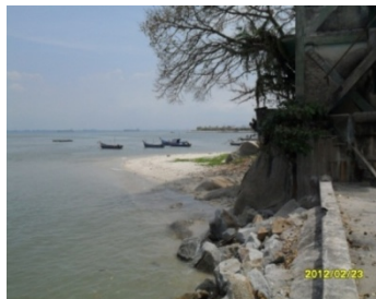
Fig. 3: Location 2-north of Tg. Tokong