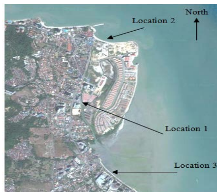
Fig. 1: Sampling locations (based map sourced from Google earth)

At each location, a 25 L of sample were collected and also in situ measurements of water temperature