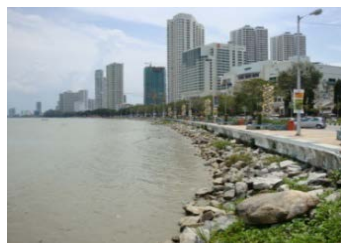
Fig. 4: Location 3-beachfront of Gurney drive

Besides that, the pH value for Sg. Fetes was 6.91; North Tanjung Tokong and Gurney Drive have higher pH value which was 8.0 and 7.48, respectively. Most water bodies have pH range of 6 to 8. If the pH falls below 6, it has harmful effects for the ecological (Lenntech, 2012). Extreme pH can kill adult fish and invertebrate life directly and can also damage developing fish. When the pH of freshwater becomes highly alkaline, the effects to marine life include death and damage to outer surfaces.