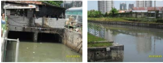
Fig. 2: Location 1-Sg. Fetes downstream